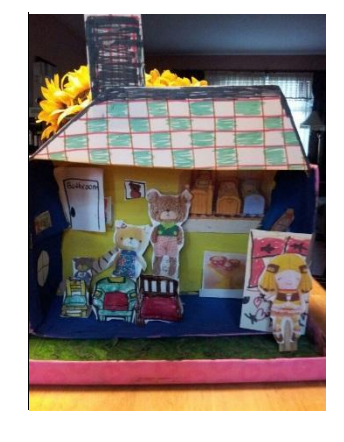
Goldilocks and the three bears