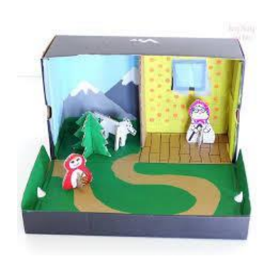
Red Riding Hood

Make a story box for a traditional tale. Here are some ideas.