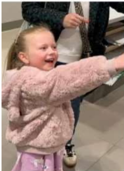
MY HAPPY PLACE Art battle competition For John Lewis Cheadle

We hope you enjoy celebrating Stockport's talented young artists with us.