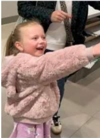
MY HAPPY PLACE Art battle competition For John Lewis Cheadle

We hope you enjoy celebrating Stockport's talented young artists with us.